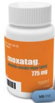
TABLET AND BOTTLE SHOWN ARE NOT ACTUAL SIZE