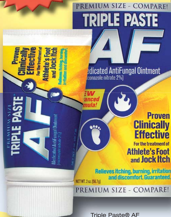
Triple Paste ® AF AntiFungal Ointment [miconazole nitrate 2%]